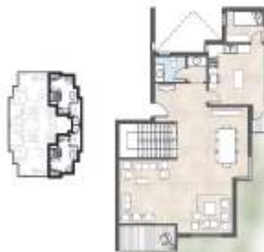
UNIT-T1/T2 Duplex Lower Floor

Type -J Typical Floor Plan Gross Area: 214 sqmeters