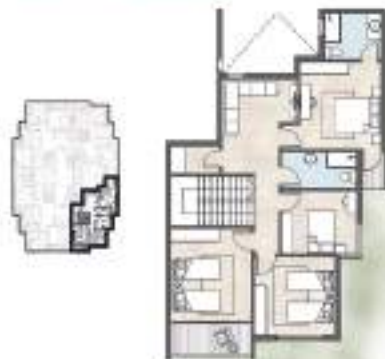
UNIT-01 Duplex Upper Floor

Type -J FIRST Floor Plan GROSS AREA: 271 SQ.METER