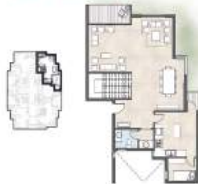
UNIT-02 Duplex Lower Floor

Type -J Ground Floor Plan GROSS AREA: 274 SQ.METER