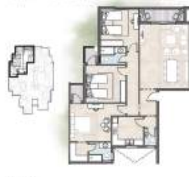
Dejoya Residences Type-B Ground Floor Plan Gross Area: 113,844.01 sq. ft.