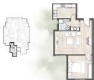
Dejoya Residences Type-B Ground Floor Plan Gross Area: 113,844.01 sq. ft.