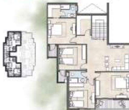
UNIT-T3/T4 Duplex Upper Floor

Type -J Typical Floor Plan Gross Area: 344 sqmeters