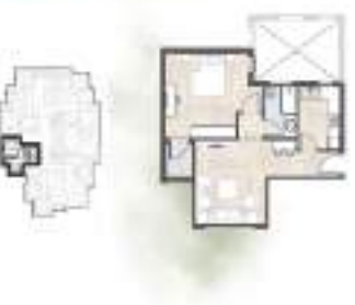
Dejoya Residences Type-B Typical Floor Plan Gross Area: 113,844.01 sq. ft.