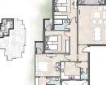
Dejoya Residences Type-B Typical Floor Plan Gross Area: 113,844.01 sq. ft.