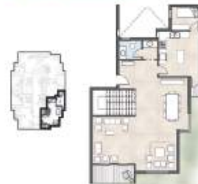
UNIT-01 Duplex Lower Floor

Type -J Ground Floor Plan GROSS AREA: 271 SQ.METER