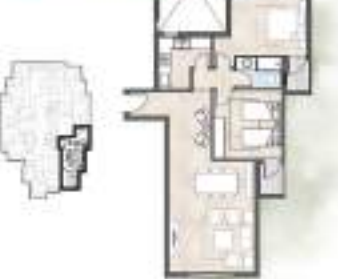
Dejoya Residences Type-B Typical Floor Plan Gross Area: 113,844.01 sq. ft.