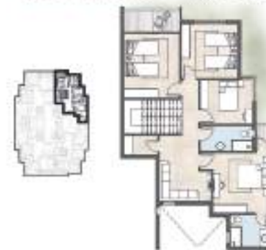
UNIT-02 Duplex Upper Floor

Type -J FIRST Floor Plan GROSS AREA: 274 SQ.METER