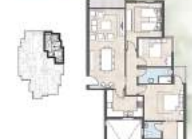
Dejoya Residences Type-B Typical Floor Plan Gross Area: 113,844.01 sq. ft.