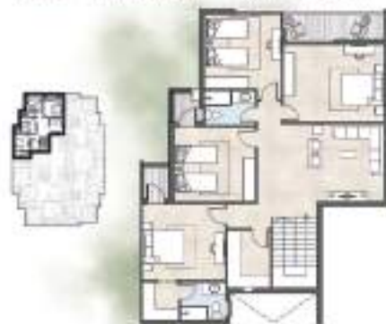
UNIT-03 Duplex Upper Floor

Type -J FIRST Floor Plan GROSS AREA: 341 SQ.METER