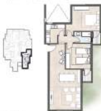
Dejoya Residences Type-B Ground Floor Plan Gross Area: 113,844.01 sq. ft.