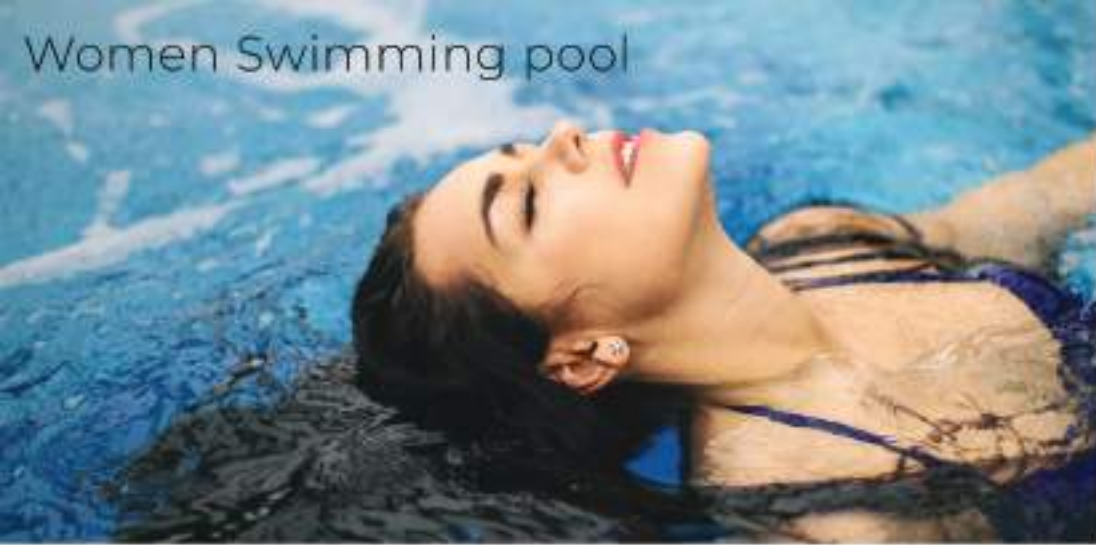
Women Swimming pool