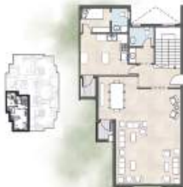
UNIT-04 Duplex Lower Floor

Type -J Ground Floor Plan Gross Area: 187 sqmeters