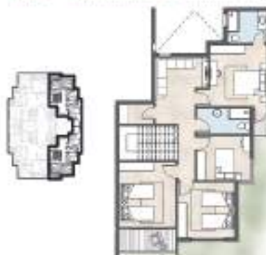
UNIT-T1/T2 Duplex Upper Floor

Type -J Typical Floor Plan Gross Area: 214 sqmeters