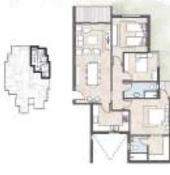
Dejoya Residences Type-B Ground Floor Plan Gross Area: 113,844.01 sq. ft.