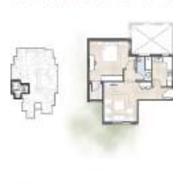
Dejoya Residences Type-B Ground Floor Plan Gross Area: 113,844.01 sq. ft.