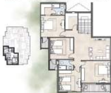
UNIT-04 Duplex Upper Floor

Type -J FIRST Floor Plan GROSS AREA: 331 SQ.METER