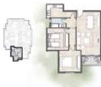
Dejoya Residences Type-B Typical Floor Plan Gross Area: 113,844.01 sq. ft.