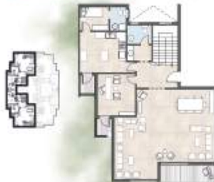
UNIT-T3/T4 Duplex Lower Floor

Type -J Typical Floor Plan Gross Area: 344 sqmeters