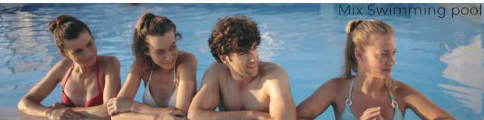
Mix Swimming pool