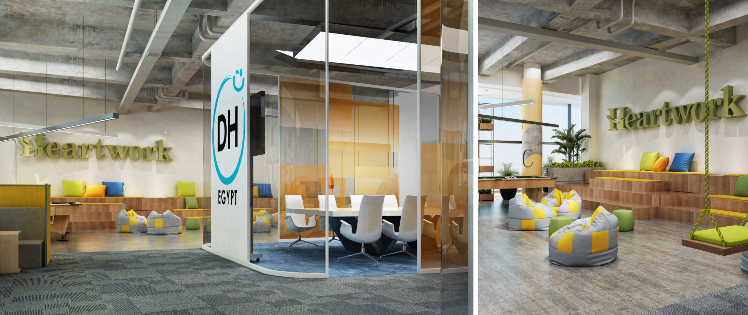
SHARED VALUE MEETING ROOMS