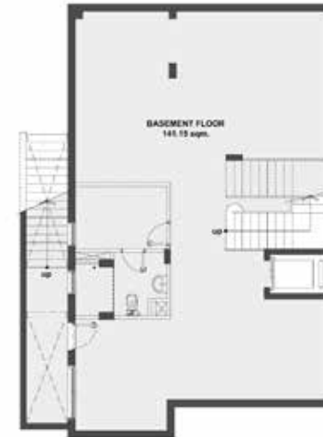
OPTIONAL BASEMENT AREA = 141.70M2