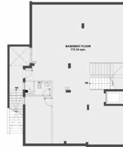
OPTIONAL BASEMENT AREA = 172.5 M 2