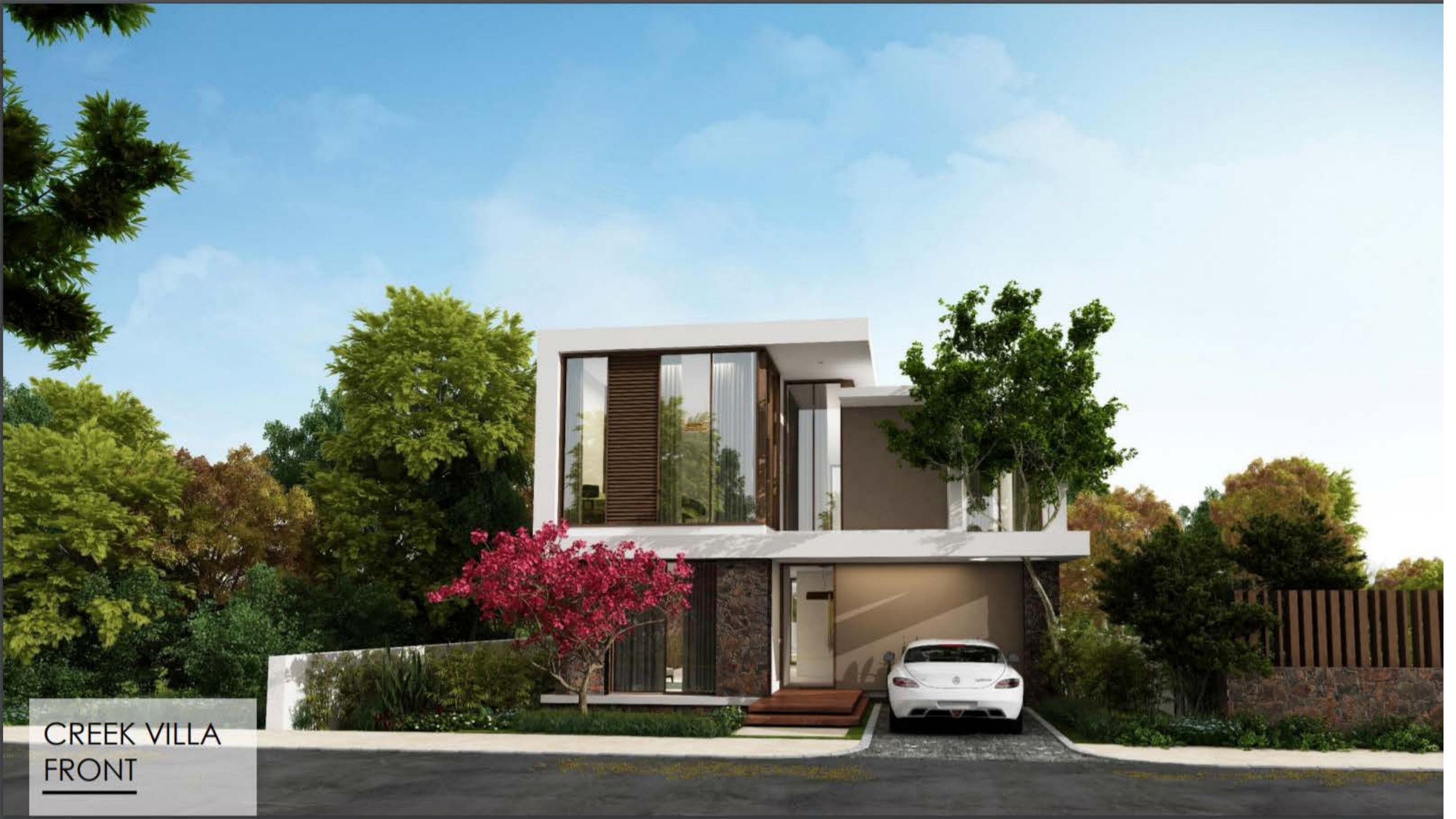
CREEK VILLA FRONT