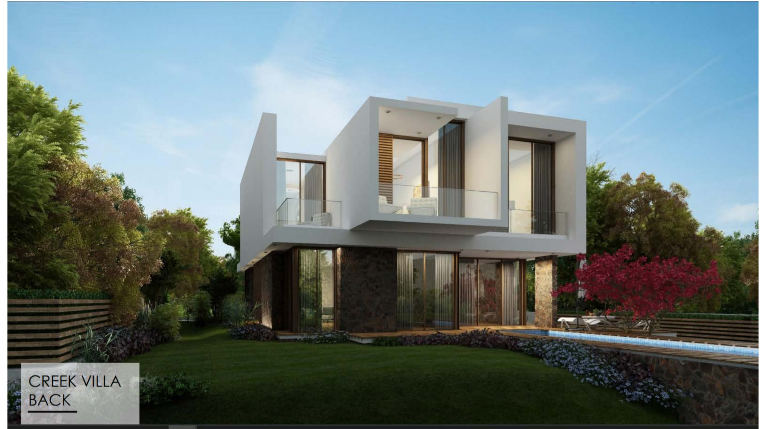
CREEK VILLA BACK